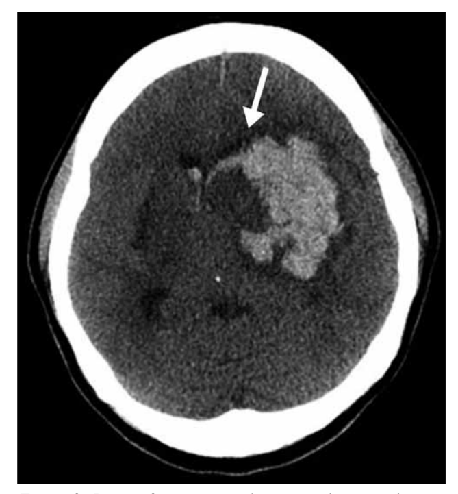
Figure 2. Patient 2: a computed tomography scan showing left intracranial and intraventricular haemorrhage (arrow)

On day 6, CT showed cerebral oedema and further