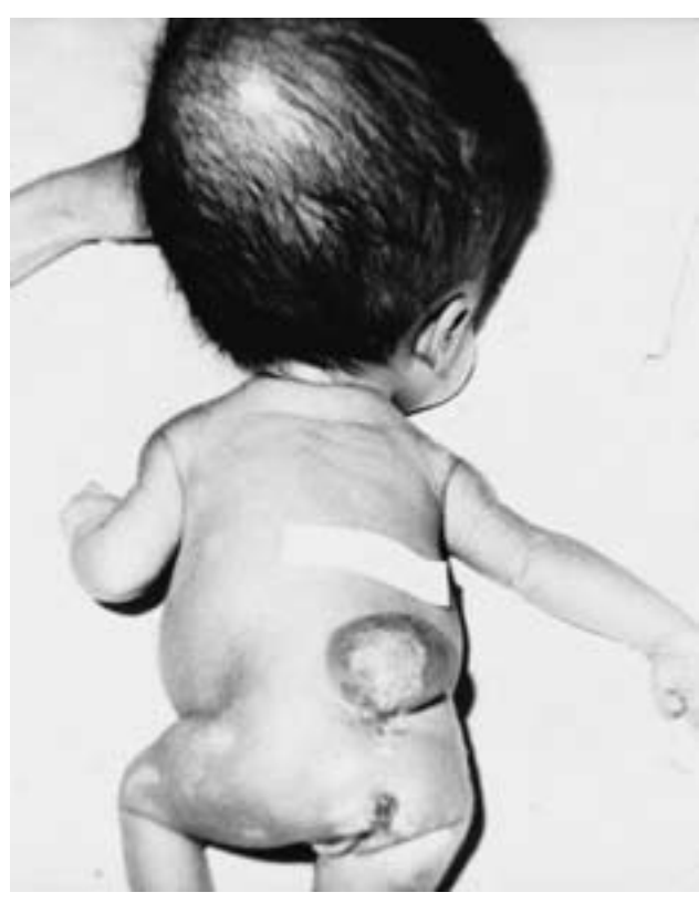
Figure 17. Meningocele and hydrocephalus