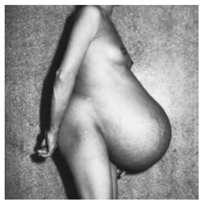
Figure 10. Pendulous abdomen of the grand multipara

Opposite the Tsan Yuk Hospital was a playground