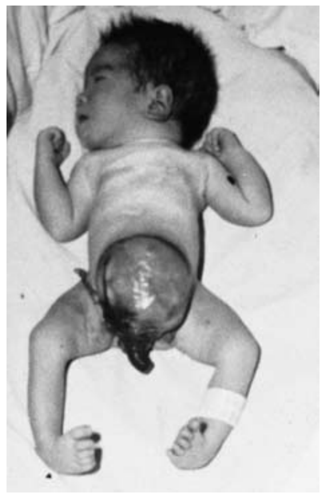
Figure 16. Exomphalos