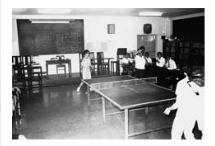
Figure 21. Table-tennis match in the Lecture Hall of Tsan Yuk Hospital