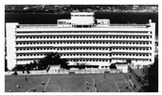
Figure 18. Tsan Yuk Hospital and the opposite playground