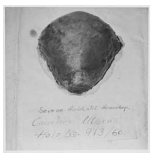
Figure 12. Couvelaire uterus in concealed accidental haemorrhage