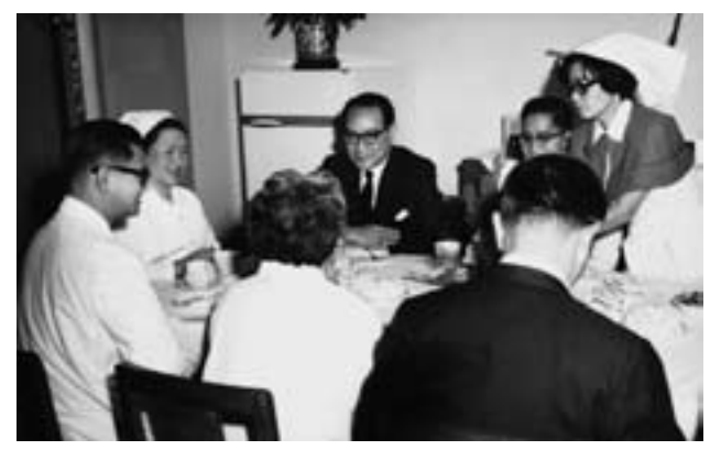
Figure 6. Tea reception after Christmas visit

For a long time there was no air-conditioning