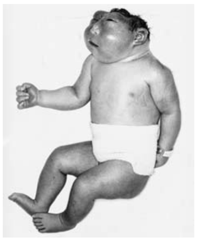
Figure 14. Anencephaly

These are some of the stories that I can recall. If told by some other person it may be a different story altogether.